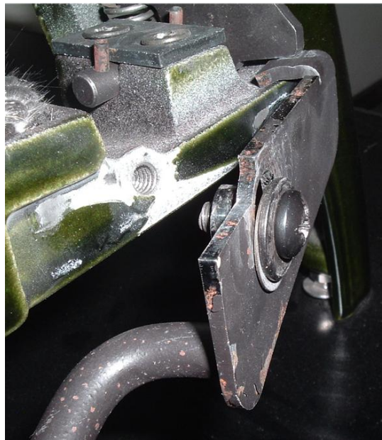
Photo 3: The ash lever pulled away from the top of the ash door. Ash door is open and tilted door for access.